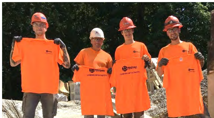
Leading with Safety Program Recipients

Methuen Construction's safety commitment is led by its Corporate Safety Director, Safety Manager and several dedicated Site Safety & Health Officers. This commitment to safety helps us maintain an EMR well below the industry standard of 1.0.