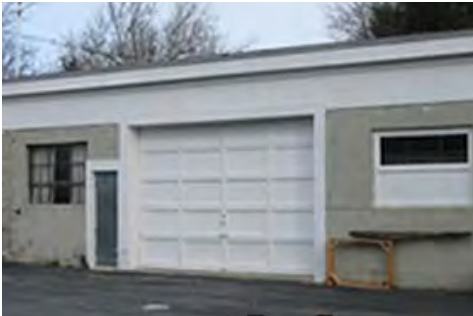
Original Headquarters - 1960