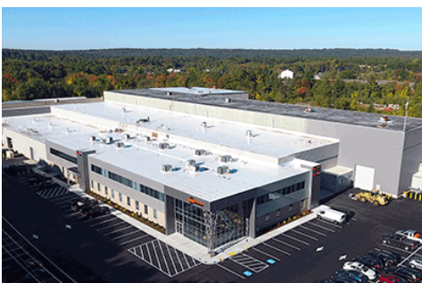
Current Headquarters in Plaistow, NH - 2016