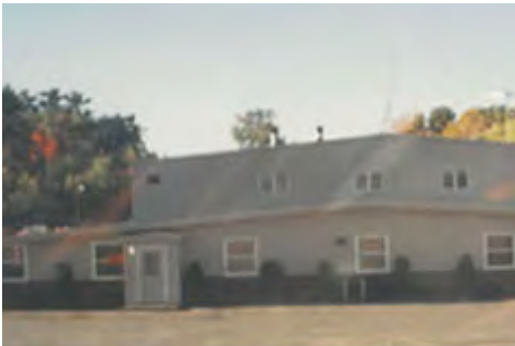
Headquarters Expands to Methuen, MA - 1972