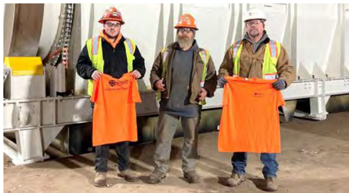
Leading with Safety Program Recipients

Methuen Construction's safety commitment is led by its Corporate Safety Director, Safety Manager and several dedicated Site Safety & Health Officers. This commitment to safety helps us maintain an EMR well below the industry standard of 1.0.