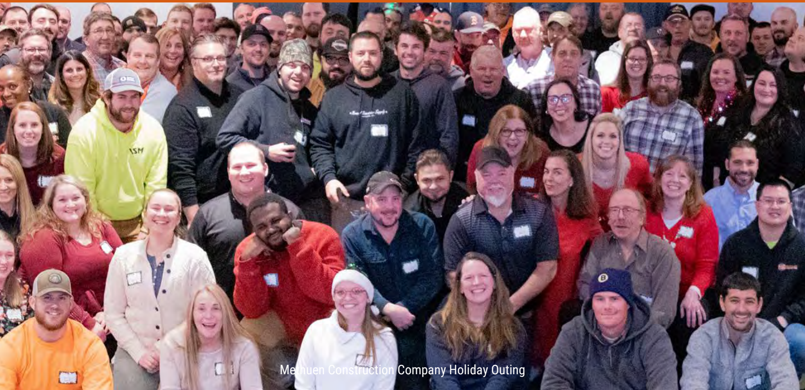
Methuen Construction Company Holiday Outing

The Methuen Way identifies the five core, ethical values that represent who we are as an organization. At Methuen Construction, it is important that our individual decisions incorporate the following core values: