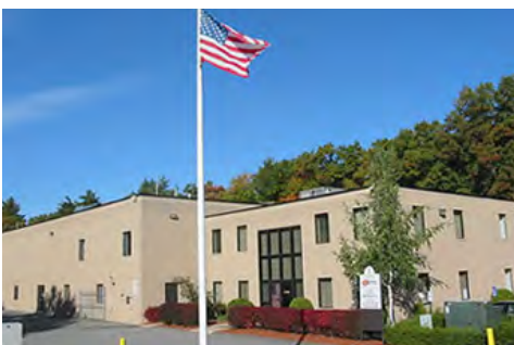
Headquarters Expands Again to Salem, NH - 2001