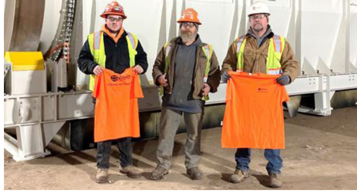
Leading with Safety Program Recipients

corporate safety and compliance programs, including safety orientation, training and certifications, site inspections, corporate and site-specific safety manuals, safety steering committee, safety committee, safety recognition program, subcontractor orientation, job safety analysis, process safety management, compliance and documentation.