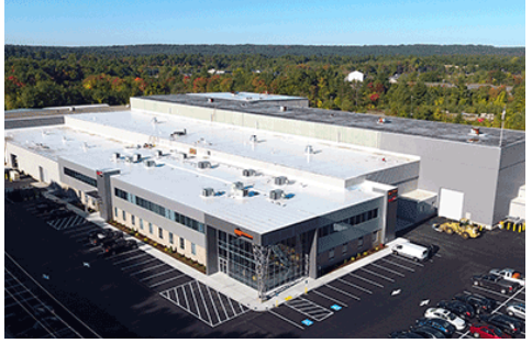
Current Headquarters in Plaistow, NH - 2016