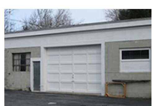
Original Headquarters - 1960